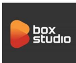
Box Vietnam Joint Stock Company